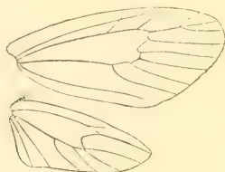
Zygænopsis flavibasis .

In this species vein 9 of fore-wing gives off 7 and 8 together.