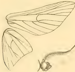
Genus Ticera .