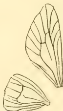
Chalioides vitrea . Hampson.