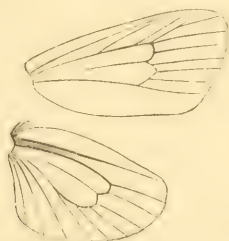
P. Moëlleri . Elw.