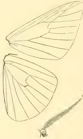
Genus Chenuala .