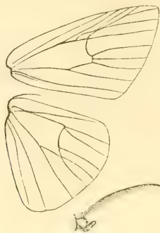
Numenes siletti ♂.