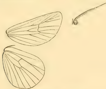
Anaxidia lactea . Swinhoe.